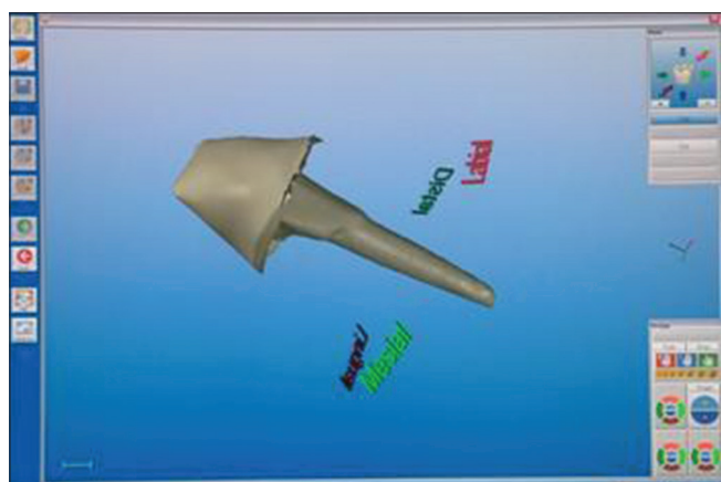
Figure 1: Aspect of Test 1 group specimen before milling

After cementation, excess cement was cleaned and all optical impressions were made with Cerec 3D inEos. 33 similar crowns were fabricated from an all-ceramic material (CerecBlocs, Bensheim, Germany) in the same dimensions with the help of software by CAD/CAM technique. The crowns were adhesively luted with RelyX ARC in accordance with the manufacturer's instructions.