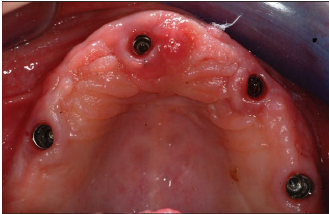
Figure 5: Intra-oral occlusal view of the maxilla after removal of the gold bar retainer

In the present report, a simple, efficient, yet accurate technique for the repair of fractured bar retainer for a maxillary implant-retained overdenture is described. These fractures can be