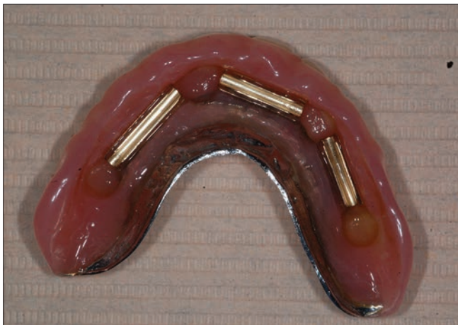
Figure 1: Intaglio surface of the metal framework reinforced maxillary implant overdenture with reduced palatal coverage showing three metal riders

U-shaped Dolder bars (H 3.0 mm, regular, Elitor® Straumann®) soldered to gold copings, made to fit passively. The framework-reinforced overdenture prosthesis incorporated three corresponding riders/clips (Straumann®, Dolder matrix, regular) acting as matrices on the intaglio surface providing attachments to the bar retainer [Figure 1]. It was clear that the gold bar fractured mesial to the gold coping at implant 24 but was not displaced [Figure 2]. The maxillary implant overdenture prosthesis was found to be satisfactory with regards to fit, occlusion, aesthetics, and phonetics, however, was unstable due to the fracture in the supporting gold bar. The treatment plan suggested to the patient included the fabrication of a new bar retainer and maxillary IOD prosthesis. However, due to the patient's time restraint and after discussion of benefits and risks, an informed consent was developed and the decision was taken to retain the prosthesis and repair the gold bar using gold solder.