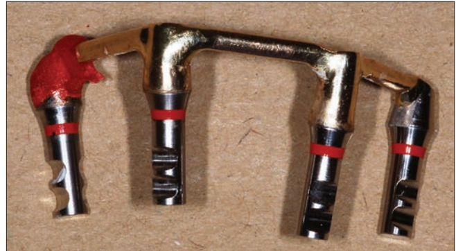
Figure 6: Compatible implant analogs (replica) secured to the gold copings on the bar retainer prior to mounting