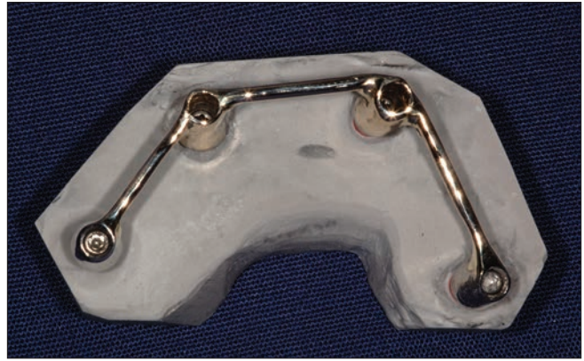
Figure 10: Repaired, finished, and polished gold bar retainer assembly, ready for intra-oral fit

The passively fitting substructure, which was fabricated, resulted in reducing the risk of future