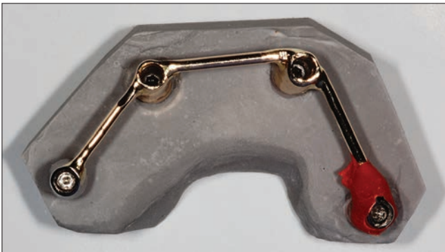
Figure 7: The gold bar retainer and implant analog assembly mounted in dental stone for positioning stability of fractured segments