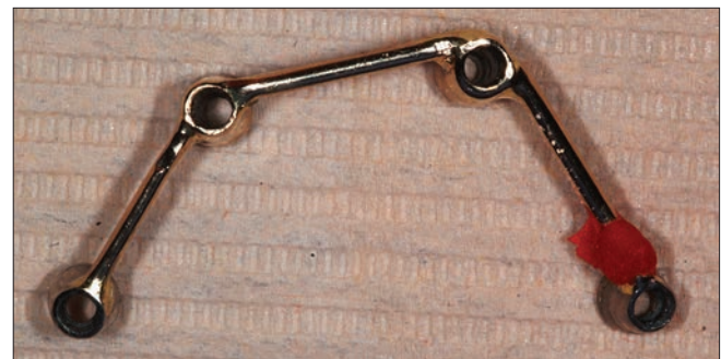
Figure 4: Splinted gold bar and coping assembly removed from the mouth to undertake laboratory procedure