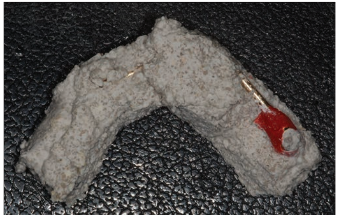
Figure 8: The mounted assembly of gold bar is invested (embedded in investment material), except the resin covered area around the fracture line for performing soldering