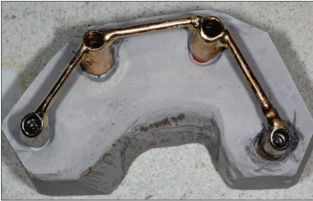
Figure 9: The soldered and divested gold bar assembly, prior to finishing and polishing

the outcome of inherent weakness of the metal alloy, inadequate dimensions and design of the bar retainer, magnitude of occlusal forces and the antagonist [16] (fixed, removable prosthesis or natural dentition), inferior solder joints, [17] and fatigue failure. [18] The fracture was located at the solder joint mesial to the left distal maxillary implant coping. Repeated complain of loose bar retainer and soft tissue inflammation indicates incomplete seating of the coping on the implant platform, [19,20] i.e., a non-passive implant coping connection. Also, a diagonal discrepancy in approximation of the fracture line was observed, reinforcing the potential for non-passive fit. The problem was compounded further by comparatively apical placement of left distal maxillary implant. The continuous stress at the implant/coping connection due to non-passive fit, apical position of implant, high occlusal forces, and inferior solder quality resulted in fatigue failure.