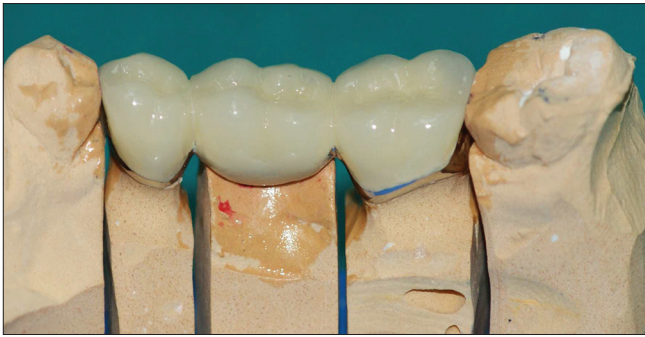
Figure 1: Definitive metal ceramic restoration