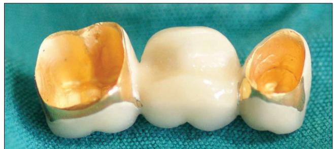
Figure 6: Restoration after gold-hard-plating

over time might have been responsible for reported discoloration and gingival problems. [10-13]