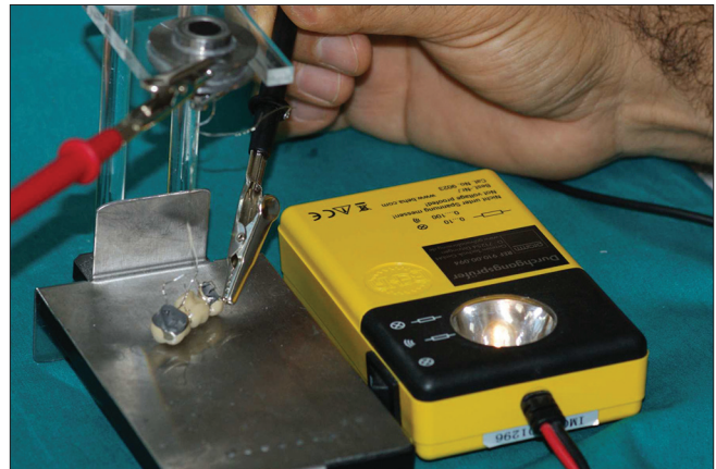
Figure 4: Evaluation of electrical contacts with contact check