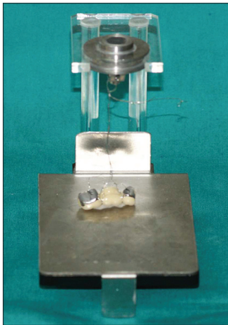
Figure 3: Measurement of distance between plate and restoration attached to hanging device with gauging tool