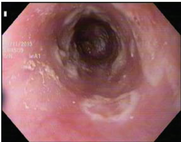
Figure 1: Endoscopic view of multiple punched out ulcers in esophagus starting from 25 cm from incisors