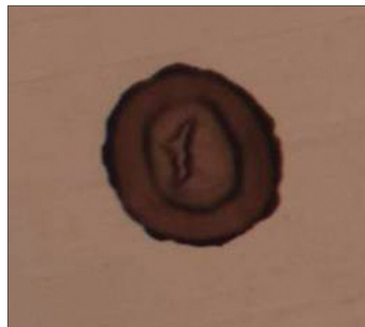
Figure 2: Low power microscopic picture of Aggregatibacter actinomycetemcomitans showing central star shaped colony

The male to female ratio in our study was 0.8:1. That is, females were more affected than males as observed in studies by Sixou et al. , [12] Salari and Kadkhoda [16] Daniluk et al. , [5] Nonnenmacher et al. [17] and Socransky et al. [6] In contrast in a study conducted by Sixou et al. [18] the ratio was M:F::1.3:1. However, there is no established, inherent difference between men versus women in their susceptibility to periodontitis. [15] 78.34% of our isolates were polymicrobial in nature in comparison to 11.06% of monomicrobial isolates. Our observations are consistent with the literature. [4,12,16,17,19] Polymicrobial nature of periodontal plaque has been well established. In the studies conducted by Sixou et al. [12] Nonnenmacher et al. [17] Saini et al. [4] and Mane et al. [19] 97.14%, 100%, 72.28% and 97.3% of their isolates were polymicrobial, respectively. In contrast Salari and Kadkhoda [16] observed 18.28% of their isolates were polymicrobial.