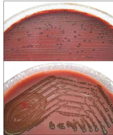
Figure 3: Prevotella intermedia

In the present study, Gram-negative anaerobes (78.4%) were predominantly isolated than the Gram-positive (21.6%) in the periodontitis cases. And our observations are comparable to the literature. [4-6,16,19] Fusobacterium spp (27.60%), Bacteroides fragilis (21.84%), Porphyromonas spp (24.48%), Prevotella intermedia (9.20%) [Figure 3], Fusobacterium nucleatum (4.60%) and Prevotella spp (9.20%) were the most common organisms isolated in our study. Other workers have isolated similar anaerobes, but in varying proportions. In an Indian study by Saini et al. [4] reported a much higher number of these isolates Porphyromonas spp 40%, P. intermedia 12%, Prevotella species 14%, Fusobacterium nucleatum 24% and Bacteroides