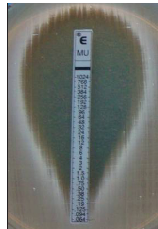
Figure 2: Interpretation of mupirocin E-test