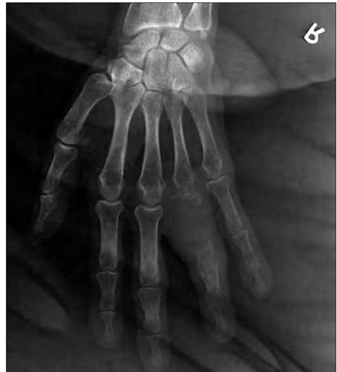
Figure 1: X-ray showing destruction of the first phalanx of the ring finger

Bone metastasis in distal parts of the extremities is very rare. [9-11] The first clinical description of peripheral