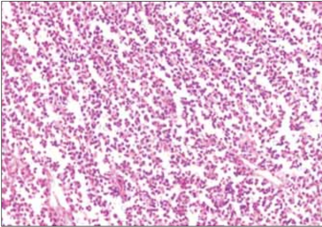
Figure 1: Diffuse sheets of monotonous medium-sized cells (×10)