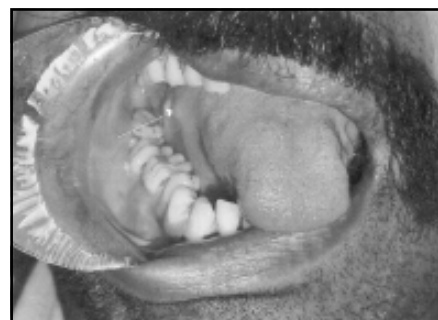
Figure 1 Lesion on lateral border of tongue (before Chemotherapy)

CASE: A 40 year male patient presented with history of slowly growing swelling on right lateral border of tongue of 2 months duration. He had no other symptoms like fever, night sweats, weight loss. Local examination revealed 5cm x 4cm firm nodular lesion involving lateral margin of right half of tongue (Fig 1). Other parts of oral cavity, oropharynx, and neck were normal. Systemic examination including