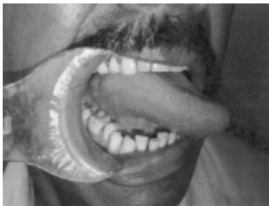
Figure 4 Complete Regression of lesion (After 1 st cycle of chemotherapy)

(CK), CD-3, Vimentin, S-100 suggestive of Primary Non Hodgkin's Lymphoma Large B cell type. He was staged as IE. He was put on CHOP (cyclophosphamide, vincristine, adriamycin, prednisolone) chemotherapy. Post first cycle of chemotherapy, the lesion completely disappeared. (Fig 4). Further, he received 3 more cycles of CHOP, after which he did not turn up for subsequent radiotherapy.