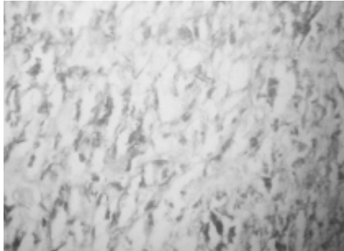
Figure 3 Immunohistochemical evaluation positive for CD 20 (40x)

histochemical evaluation was positive for LCA and CD 20 (Fig 3) and negative for Cytokeratin