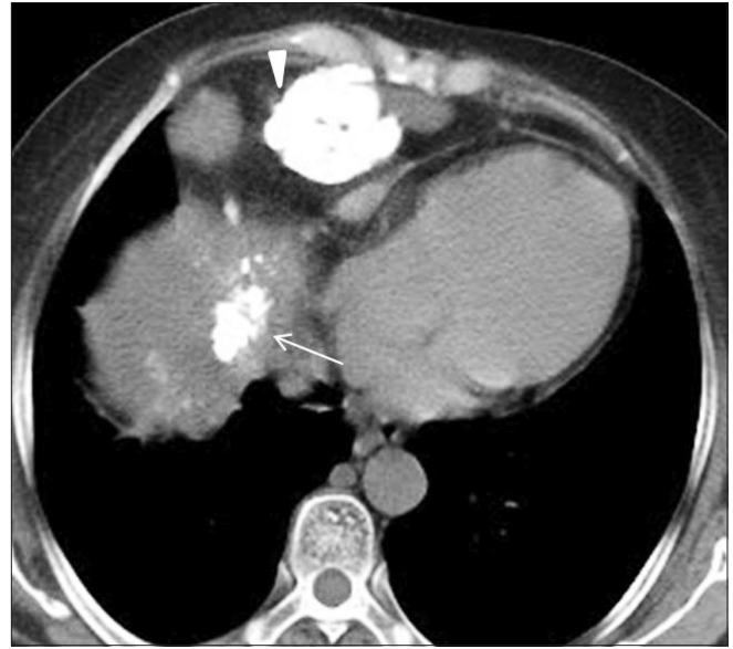
Figure 2: CT scan of the upper abdomen shows a calcified deposit (arrow) in a Morgagni hernia (arrowhead)