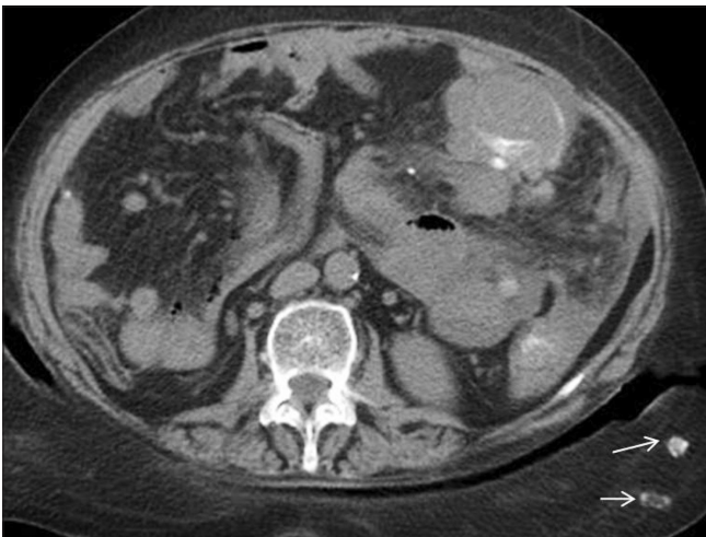
Figure 3: CT scan of the mid-abdomen shows subcutaneous deposits (arrows)