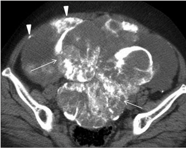
Figure 1: CT scan of the pelvis shows calcified ovarian mass lesions (arrows) in the pelvis, along with calcified peritoneal deposits (arrowheads)