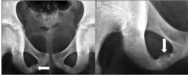
Figures 1 (A,B): Anteroposterior pelvic radiograph (A) showing both ischiopubic rami and a magnified view (B) of the right ramus show an enlarged right ischiopubic synchondrosis (IPS) with osteolysis and lucencies (arrows)

A 12-year-old right-footed male presented with left hip pain and inability to walk. He denied traumatic events and reported difficulty in playing football. Moreover, he had never been treated with antibiotics or anti-inflammatory drugs. Laboratory tests were unremarkable except for a slight increase in CRP. ASO titer was also normal.