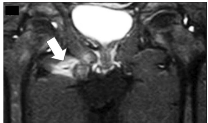
Figure 4: Coronal, fat-saturated TSE T2W MRI image after therapy (4 weeks later) shows a mild decrease in the perilesional edema (arrow)