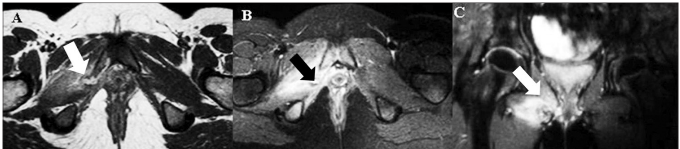
Figures 2 (A-C): Axial turbo spin-echo (TSE) T2W (A), axial, fat-saturated, TSE T2W (B) and coronal, fat-saturated TSE T2W (C) MRI images demonstrate hyperintensity due to edema in the adjacent soft tissues (white arrows) and hyperintense signal in the right IPS centered by a hypointense band (black arrow)

A radiolucent swelling at the ischiopubic fusion zone in the prepubescent skeleton was firstly described by Odelberg (1923) and Van Neck (1924) as “osteochondritis ischiopubica.” [9,10] At present, this finding is considered a normal ossification pattern [11] since closure of the IPS is variable and can occur at an age from 4 to 16 years. Asymmetry in closure is the rule rather than the exception. In fact, in older children, before complete ossification, a unilateral enlarged IPS is commonly seen. [12] As reported in literature, unbalanced mechanical stress, such as kicking or jumping, may induce an inflammatory reaction and a delayed complete ossification of this synchondrosis. [2,3,13,14] The IPS is composed of hyaline cartilage; and its cell layers, before fusion, show a strong enhancement on hematoxylin