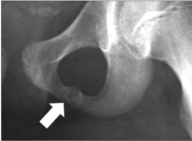
Figure 5: Anteroposterior pelvic radiograph shows enlargement of the left IPS with radiolucency (arrow)