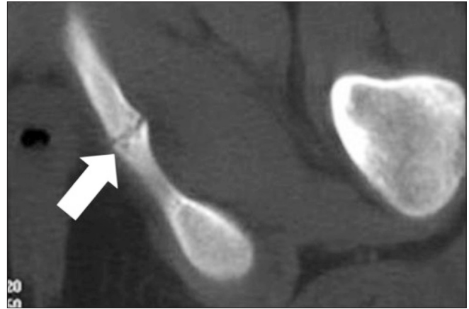
Figure 6: Axial CT scan shows delayed closure of the left IPS and irregular bone margins (arrow)

Its tumor-like appearance on conventional radiographs may be mistaken for stress fracture, tumor, or inflammation. The radiographs and CT scans are usually typical showing increased size with lucencies and sclerosis, as seen in our patients. The typical MRI features such as signal alteration of the bone marrow and fusiform swelling of the adjacent soft tissue were also seen in our patients. We also detected a hypointense band-like structure perpendicular to the pubic axis, defined by Herneth et al. as “fibrous bridging,” a typical MRI feature of this structure. [2,16,17]