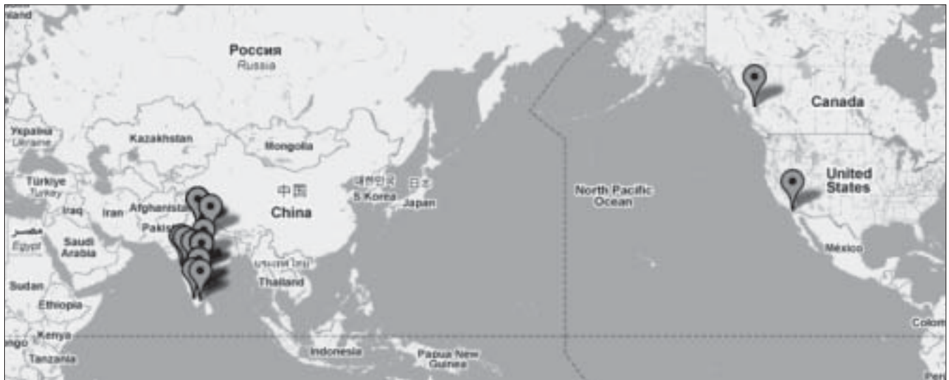
AUTHOR INSTITUTION MAP FOR THIS ISSUE

Please note that not all the institutions may get mapped due to non-availability of requisite information in Google Map. For AIM of other issues, please check Archives/Back Issues page on the journal's website.