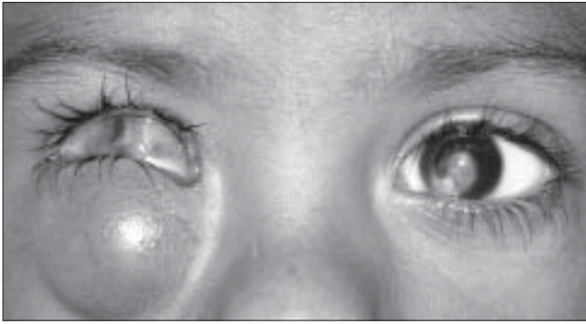
Figure 1: Photograph of the patient on presentation. There is a globular swelling under the right lower lid that has pushed the globe upward. The patient also has bilateral corneal opacities.

etiology of a colobomatous cyst is not exactly known but it is presumed to occur due to improper fusion of the embryonic fissure between the 7–14 mm stage of fetal development. This results in abnormal ectasia of the sclera, which expands into the adjacent orbit. [3] Usually, the uveal contents do not develop in the region of the coloboma.