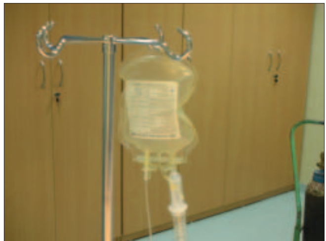
Figure 1: The blood bag inflated with CO 2 is depicted

The system developed at our institute has been used for CO 2 angiograms for many years now. It consists of a standard blood bag (readily available) connected to a CO 2 cylinder [Figure 1]; this is done in order to avoid direct transmission of pressure from the cylinder to the vasculature under