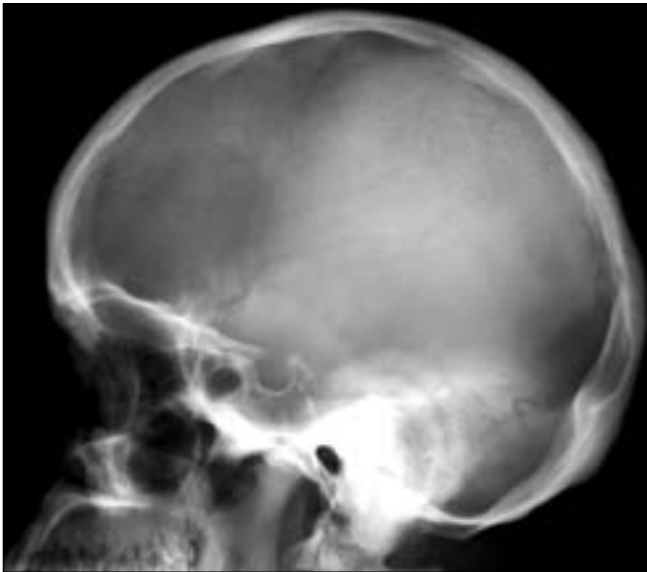
Figure 5: Lateral radiograph of the skull shows hyperostosis of the calvaria and skull base bones with a normal sella and sinuses