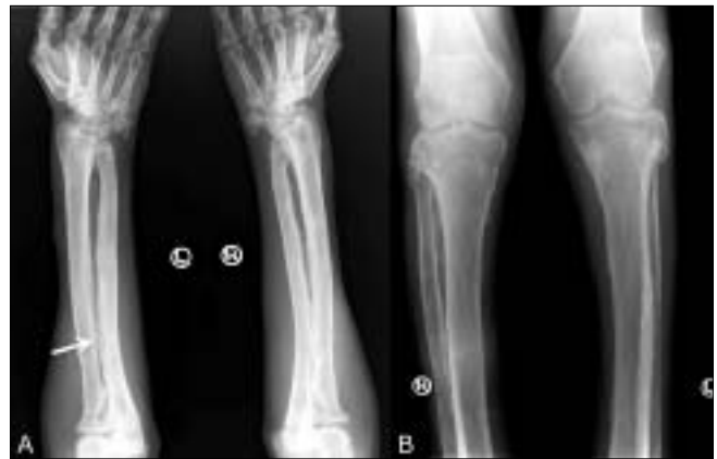
Figure 2 (A,B): Anteroposterior radiographs of both forearms (A) and upper legs (B) show symmetric, shaggy periosteal proliferation extending up to the epiphyses, with expansion of the radius and ulna at the wrist and of the tibia and fibula at the knee, along with calcification of the interosseous membranes (arrow)

Based on the clinical and radiological findings, a diagnosis of the classic or complete form of PDP or idiopathic hypertrophic osteoarthropathy was suggested. Histopathological examination of the skin demonstrated an increase in dermal collagen, hyperkeratosis, and acanthosis, with no evidence of any acid-fast bacilli.