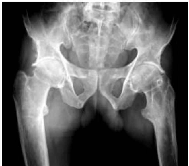
Figure 4: Anteroposterior radiograph of the pelvis (including both hips) shows symmetric and shaggy periosteal proliferation in the lower part of the iliac bones. There is widening of the femoral metaphyses with reduction of hip joint space on both sides, without any abnormality of the articular surface