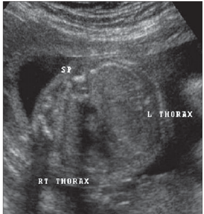
Figures 2: Transverse USG of the fetal thorax - four chamber cardiac view captured five minutes later.