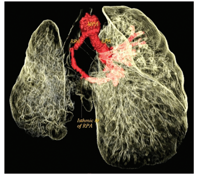
Figure 4: Volume-rendered imaging reveal findings of horseshoe lung with connecting isthmus and a branch of the right pulmonary artery coursing across the midline to the left to supply the pulmonary isthmus

Features of scimitar syndrome in the form of anomalous pulmonary venous return from the right lung to IVC and anomalous systemic arterial supply from the abdominal aorta to the right lung base were seen in 11 of the 14 cases studied by Frank et al. <sup>[7]</sup> as well as in our case, which could be clearly demonstrated on CT images. There was