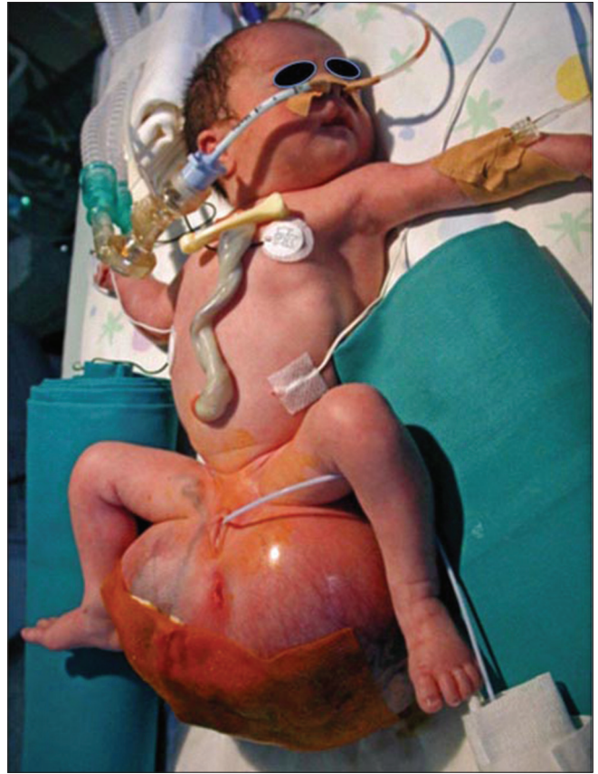
Figure 2: Photo of the patient with the giant sacrococcygeal teratoma after birth