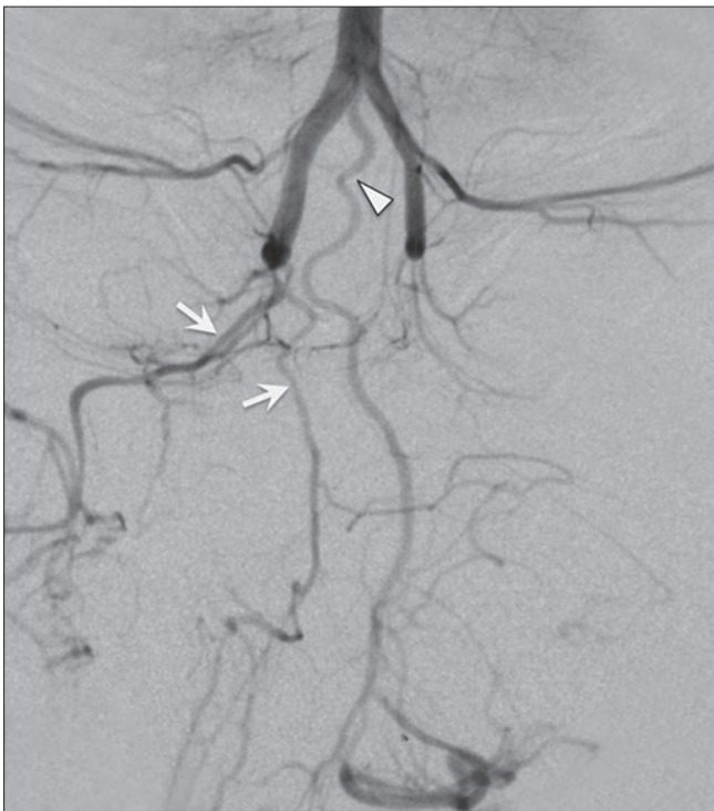
Figure 3: Abdominal aorta angiography that confirms the highly vascular nature of the mass with hypertrophy of the middle sacral artery (arrowhead) and distal vessels from the right internal iliac artery (arrows)