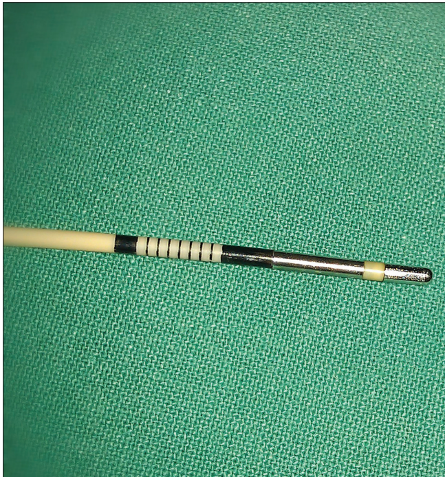
Figure 1: Bipolar probe: Two poles are separated by a white insulator. The wider black mark on the shaft serves as an indicator: when it is visible at the puncture site the operator should terminate the procedure