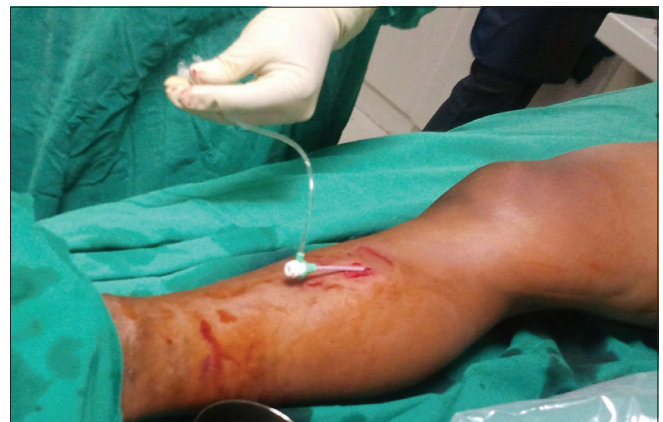
Figure 2: A 70-cm long 6F sheath is placed in the GSV; through this the RFA probe is introduced

Endovenous RFA is a minimally invasive technique for the treatment of varicose veins. In bipolar RFITT, the venous wall acts as a conductor between the two poles. [3] The high-