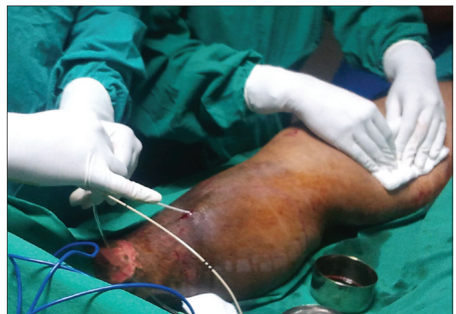
Figure 4: The sheath and RFA probe are being steadily withdrawn, at approximately 0.5 cm per second, such that the acoustic signal is maintained at a constant frequency and pitch