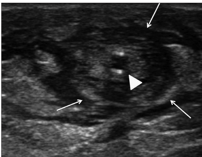
Figure 3: Transverse USG shows perivenous tumescent fluid (arrows) around the sheath in the long saphenous vein (arrowhead)