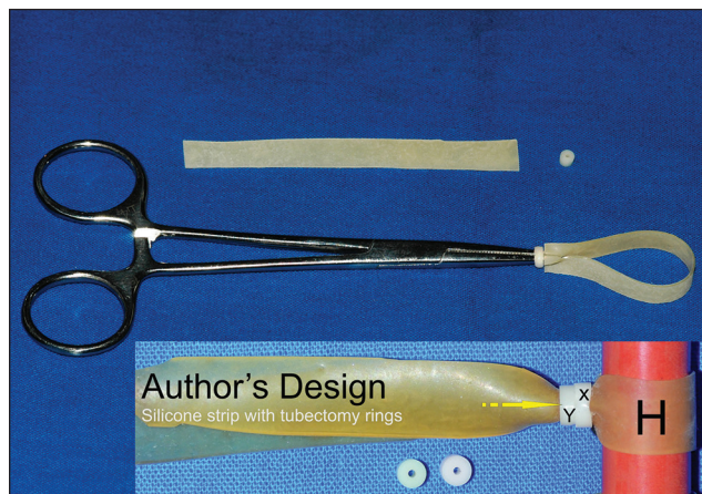
Figure 2: Authors' design of the penile tourniquet