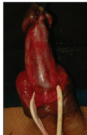
Figure 4: Local tissue damage using tubular tourniquet (rolled glove tourniquet with more than recommended application time and pressure)