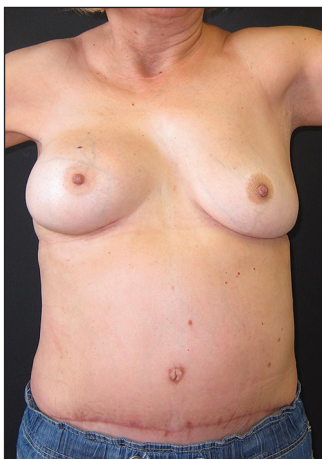
Figure 5: The patient remains free of pain and aesthetically pleased at 24 months follow-up

The use of free tissue transfer tends to become the modern workhorse for reconstructing congenital chest wall abnormalities. Gautam et al. , presented a series of 8 Poland's syndrome cases, who were treated using microvascular perforator flaps; 4 superior gluteal artery perforator, 2 inferior gluteal artery perforator, 1 superficial inferior epigastric artery and 1 DIEP flap. [4] Although all flaps survived, a relatively high complication rate was reported by the authors. However, donor-site morbidity is lower, functional compromise is less and recovery time is faster, as compared to LD muscle flap transfer procedures.