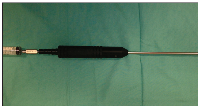
Figure 2: Photograph demonstrating the insertion of the infiltration needle within the liposuction cannula to facilitate unblocking with the syringe

used to flush out the liposuction cannula. [1] Being of appropriate length, connecting the infiltration needle to a saline filled syringe could provide a conduit through which enough pressure could be generated to flush out any fibrous tissue. It is also small in caliber and will fit into the smallest sizes of liposuction cannulae. The liposuction cannula make has no specific preference with regards to company and this technique will work with any make of liposuction cannula provided it is a size 2 cannula with a BD make of infiltration needle. Figures 1 and 2 depict the method of unblocking the liposuction cannula.