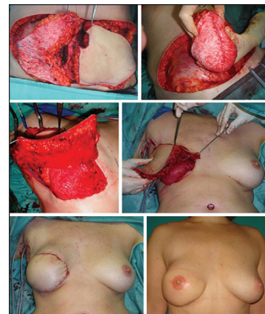
Figure 3: Monilateral double deep inferior epigastric perforator flap: The small one was V-shaped and sutured on itself on the medial edge obtaining a shape similar to prosthesis. The small flap was buried under the bigger one. The bigger flap was modeled as usual. The final effect was the increase of volume and projection of the reconstructed breast