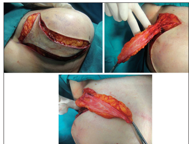
Figure 1: A vertical flap was harvested from the lateral bulkiness of the reconstructed breast. The flap was de-epithelialised and transposed to a subcutaneous pocket in the upper pole

We performed this reconstruction in a 36-year-old female patient who affected by a recurrence of a mucinous carcinoma of the right breast. Our surgical plan was to harvest DIEP flap and contralateral breast reduction, but the patient was not prepared to accept any contralateral breast scar.