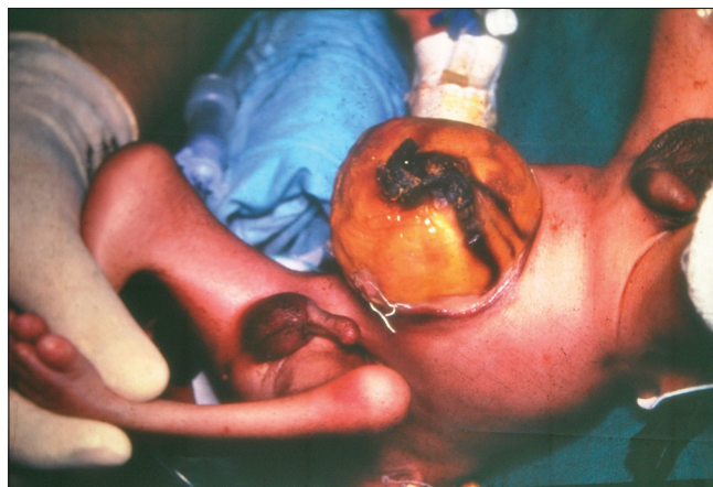
Figure 1: Epigastric heteropagus

Epigastric conjoined twins are predominantly males. In epigastric heteropagus; the parasite has duplication of the pelvis and pelvic organs, such as the complete urinary