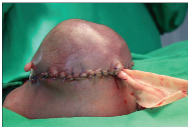
Figure 3: Post-operative outcome