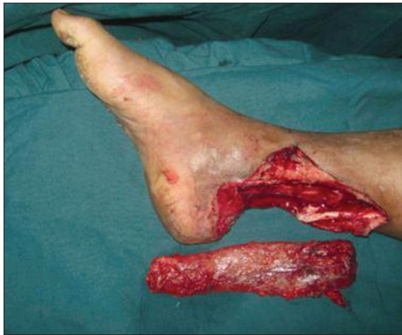
Figure 1: The picture showing the soft tissue and Achilles tendon defect of the right leg after debridement and harvested gracilis muscle

graft filling the defect was found to be shortening and transmitting the force of muscle action to the calcaneum [Figure 3]. MRI scan was also performed and the T2-weighted image showed that there is a tendon defect, which is being filled by the muscle graft and the deeper part of the muscle graft shows fatty change. The cleavage of the graft with the proximal myotendinous region and distal Achilles tendon is not visualised – suggestive of complete incorporation of the graft [Figure 4].