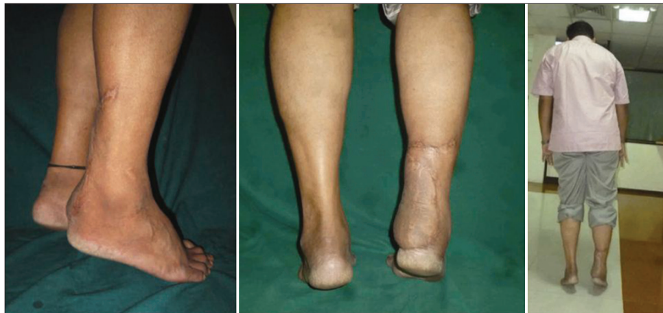
Figure 2: Follow-up at 2 years showing well settled flap and tip toe standing without any support on both legs