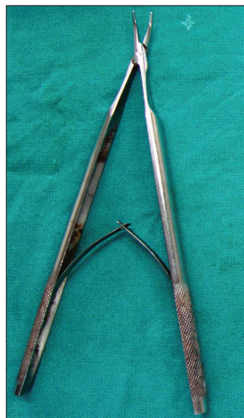
Figure 1: Pen grip needle holder for cleft palate repair

One of the lesser known things about him is that, he invented a musical instrument called Anil vadyam - literally, wind instrument. He explained the workings of this instrument to me personally. He was