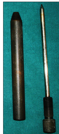
Figure 2: Wire twister