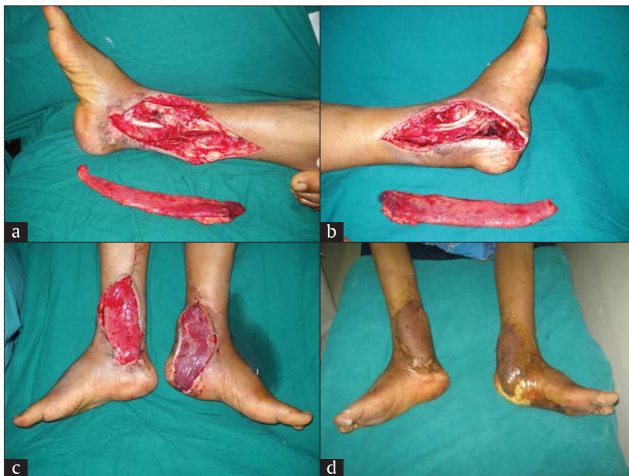
Figure 2: (a and b) A patient with bilateral lower third leg open fracture with soft tissue loss, (c) both sides covered by gracilis free flap and (d) the result at 5 weeks with complete healing of the wounds