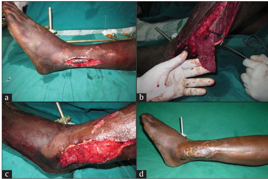
Figure 6: (a) A defect on the lateral side of the lower third of the leg and (b) the distally based peroneus brevis muscle raised retaining the last perforator. The clamp is on the proximal perforator to confirm the viability of the muscle with the distal perforator, (c) the muscle turned over to cover the defect and (d) the healed wound with a primarily closed donor defect