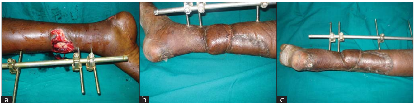
Figure 3: (a) The defect in the lower third leg exposing the fracture site, (b) covered by a reverse flow sural artery flap and (c) shows the obvious donor site

When used for lower third leg defects, one has to be sure that the link between the perforators and the arteries accompanying the sural nerve and the lesser saphenous vein are intact. In acute trauma situations, one has to be careful. Reverse flow flaps are safer for ankle and foot defects than lower third defects. Good audible Doppler signals are important before embarking on this flap. Most of the posterior aspect of the skin in the middle third of the leg can be taken as a reverse flow flap and used to cover the lower leg defects. The sural nerve is deeper to deep fascia proximal to the middle of the leg and lies between the two heads of the gastrocnemius. When elevating the flap, the proximal incision is made first and the sural nerve and the lesser saphenous vein are first identified beneath the fascia and included in the flap. As dissection proceeds distally, the base of the flap could be