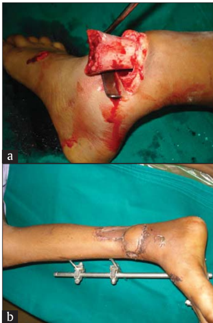
Figure 4: (a) An open fracture dislocation of the ankle which after reduction left a transverse defect which could not be primarily closed, (b) covered by a local transposition flap

These flaps are particularly useful for small- to medium-