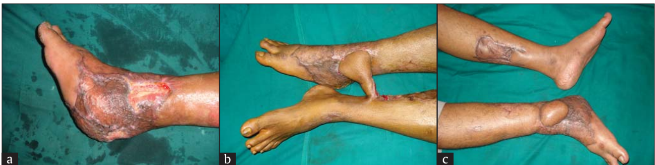
Figure 7: (a) Exposed bone in the lower third leg with graft all around in a major crush injury leg with no good proximal recipient vessels. (b) Distally based cross leg flap, where the proximal edge attaches to the length of the defect (c) after completion of reconstruction

use of negative pressure. Although the study is small, this does suggest a degree of caution in using NPWT as a delaying tactic in lower extremity trauma and suggests that the strategy of trying to close these wounds within 7 days is still essential in the era of negative pressure wound therapy.