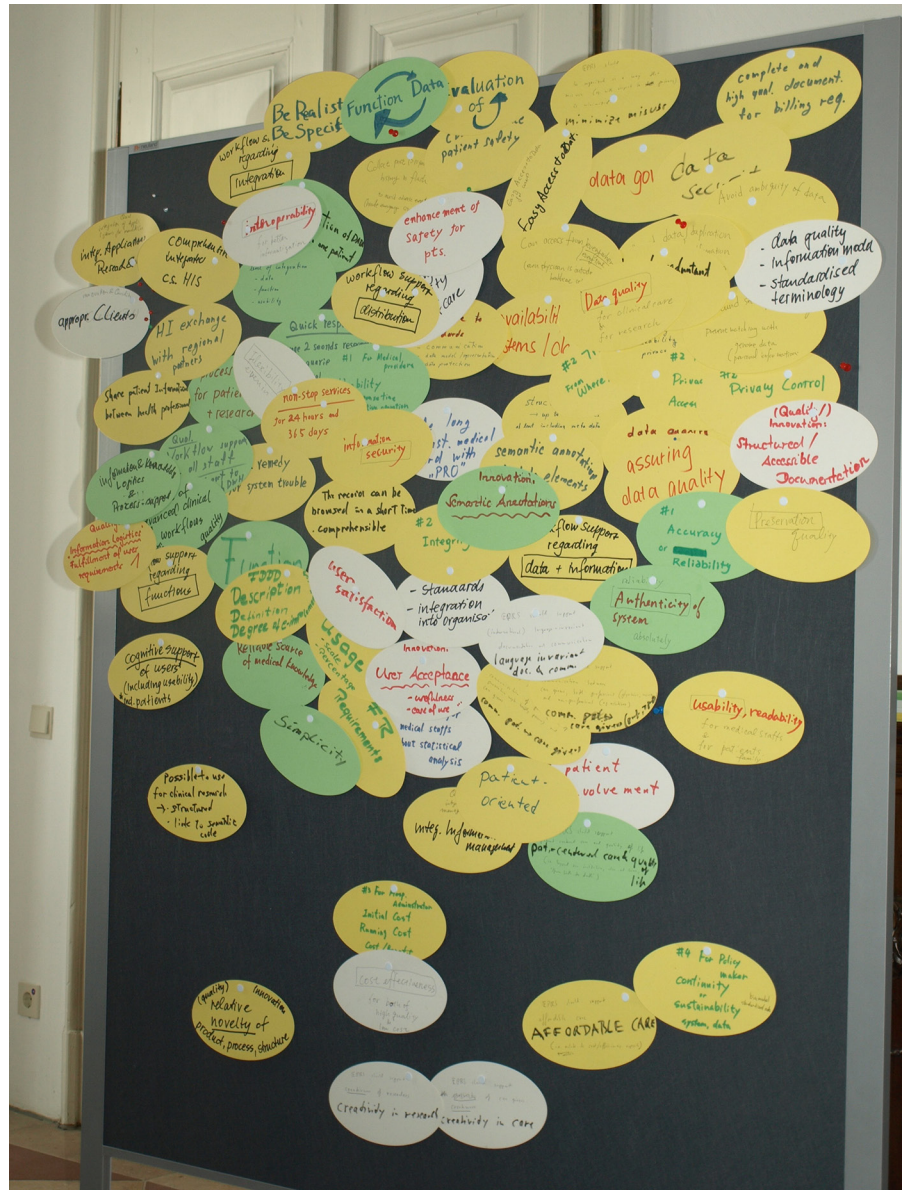
Figure 2 Results of the creativity techniques on the quality issues of EHRS.

As a result of applying the concepts of section 2.1 in JGEHRS 2014, we present (1) the hierarchical framework for systematizing the quality requirements of EHRS and (2) the requirements for the quality of EHRS as they were carved out during the workshop.