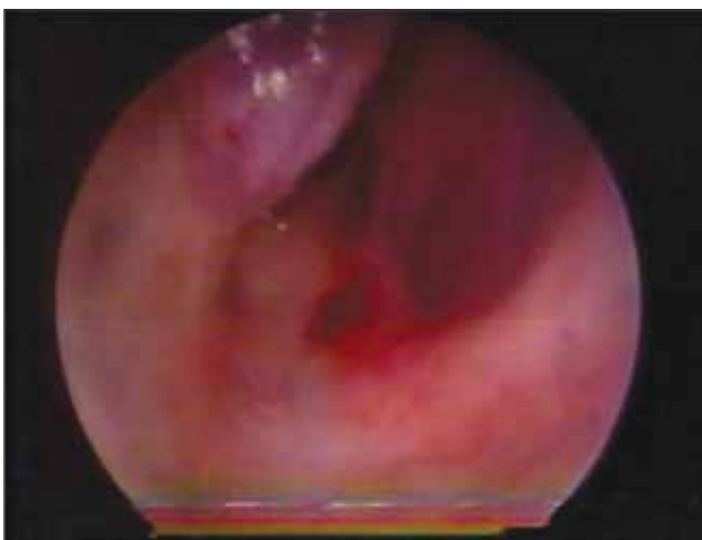
Figure 1. Endoscopic view of atresia in the right nostril.

Choanal atresia may present as an isolated malformation or in 20% to 50% of cases, part of a group of congenital malformations, such as coloboma, heart malformation, mental retardation and growth, genital anomalies and ear or deafness (4). Thus, a complete physical examination should be done by the pediatrician and otolaryngologist to identify the possibility of the presence of these anomalies. Some theories have been proposed to explain the embryological origin of this clinical entity. Among the most accepted, four stand out: 1) persistence of oral-pharyngeal membrane, 2) failure to break the physiological oronasal membrane of Hochstetter, 3) adherence of abnormal mesodermal tissue located in the nasal choana and 4) medial growth of vertical and horizontal processes palatine bone (5,6).