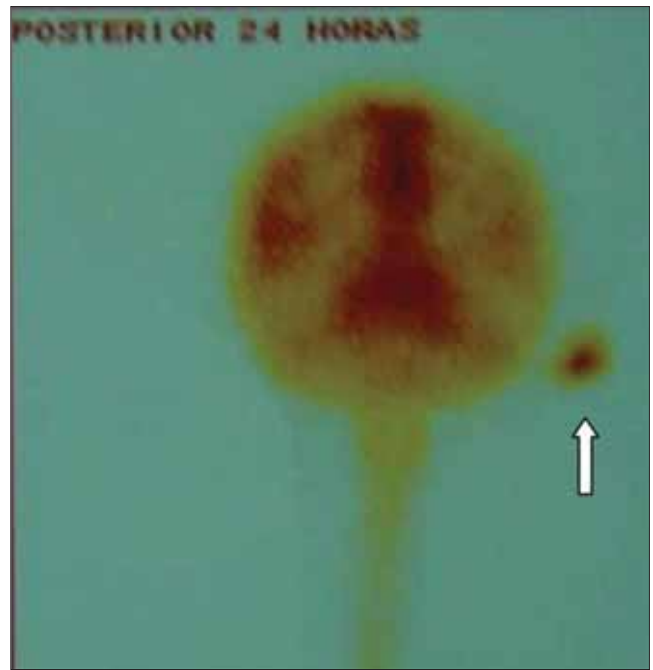
Figure 2. Cisternocintilografia - Rear - Suggestive of cerebrospinal fluid leak in the area of the right ear (arrow).