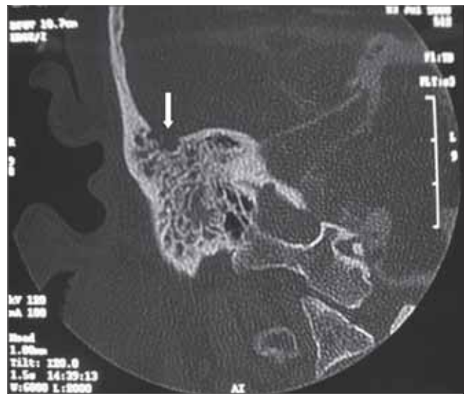
Figure 4. Cisternography of the temporal bone (coronal) - area of bony dehiscence in the tegmen tympani (arrow).

membrane. We opted for the withdrawal of ventilation tubes for while maintaining the same power to highlight the possible permanence of otorrhea, this could be ascertained by otoscopy by changes of the tympanic membrane . Moreover, the permanence of the vent pipe could facilitate the onset of infection.