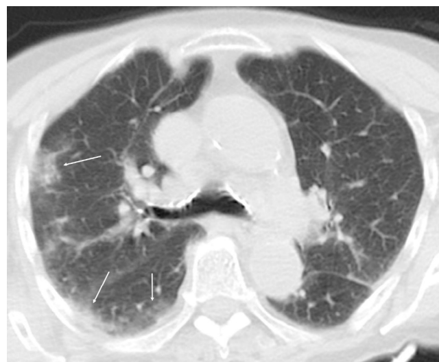
Figure 4. Axial tomography image of the chest with lung window demonstrating peripheral opacity with ground-glass attenuation in the right lung (arrows).