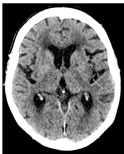
Figure 1. Axial image of cranial computed tomography showing an area of cortico-subcortical hypoattenuation with loss of white-gray differentiation in the left insular region (arrow).

hemiparesis, aphasia, and dysarthria. Cranial computed tomography (CT) (Figs. 1,2) and cranial CT angiography (Fig. 3) showed findings suggestive of acute ischemic stroke in the area of the left middle cerebral artery. The patient declared having flu-like symptoms for about two weeks, and chest CT findings were suggestive of viral infection (Fig. 4). The rapid test was performed, and the result was positive for SARS-CoV-2.