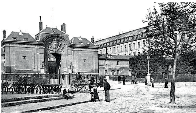
Figure 2. Kremlin-Bicêtre l'Hospice. Paris, 1906. Extracted from: http://www.leplaisirdesdieux.fr/LePlaisirDesDieux/NosAncetresLesInternes/Hopitaux/bicetre/bicetre1.jpg [accessed in June 18, 2020]

The work-addicted Pierre Marie and Édouard Brissaud founded the Revue Neurologique (1893) and the Société de Neurologie de Paris (1899) 6 . Most of his contributions occurred between his appointment to the Hospice de Bicêtre in 1897 (Figure 2) and 1907, when he accepted the position of Chair of Anatomical Pathology, school of Medicine, revolutionizing the hitherto teaching methods 1 . The worldwide renowned Neurology clinic Marie established at the Hospice attracted physicians from France and abroad, among whom was the young Brazilian doctor Aloysio de Castro, who wrote: "It was 1906. Eight o'clock in the morning, 211 Boulevard Saint Germain, and there I was in a carriage on my way to the old Hospice de Bicêtre, next to Pierre Marie. Arriving at the ward, where his senior assistants and foreign doctors were already waiting, he wasted no time, taking his coat and heading to