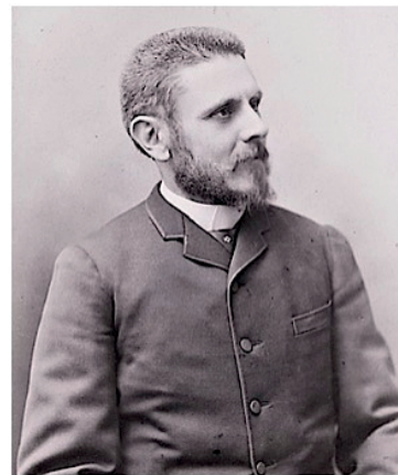
Figure 1. Doctor Pierre Marie, 1889.

hair and beard could give this actually pleasant and affable physician a false snobbish look (Figure 1); however, he had a deep, bright, and insightful mind 1 . He considered coffee