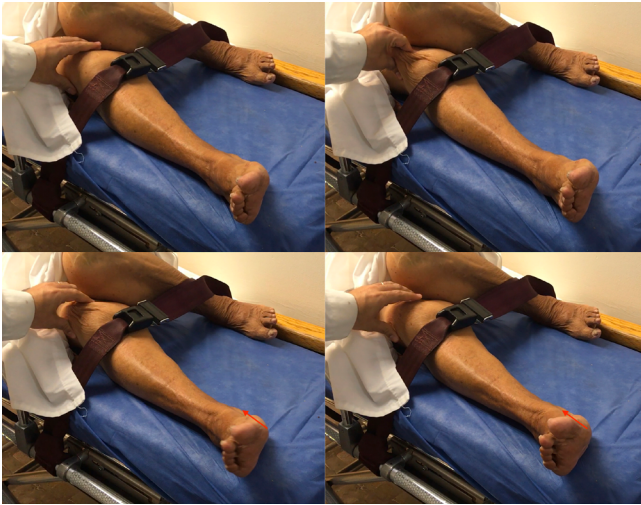
Figure 2. Austregésilo-Esposel sign. Toe extension on squeezing of the anterior aspect of the thigh.

cause of stroke ruled out cardiac embolism sources, large-artery, and small-vessel disease, and was thus classified as an embolic stroke of unknown source (ESUS) 3 .