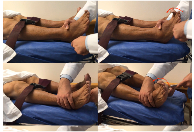
Figure 3. Computed tomography scan. Axial projection showing a hypodensity in the left hemisphere, compromising the complete left middle cerebral artery territory, which appears hyperdense (yellow arrows).

With over 30 surrogate or substitute signs for the original Babinski sign 4 , it has become a common rite of passage in some centers to test trainees on how many signs they can remember. Despite their widespread use as markers of corticospinal disease, their diagnostic yield remains controversial; and their sensitivity for detecting pyramidal tract dysfunction and inter observer agreement remains low 5 . Thus, regardless of the eponym remembered when eliciting the plantar response,