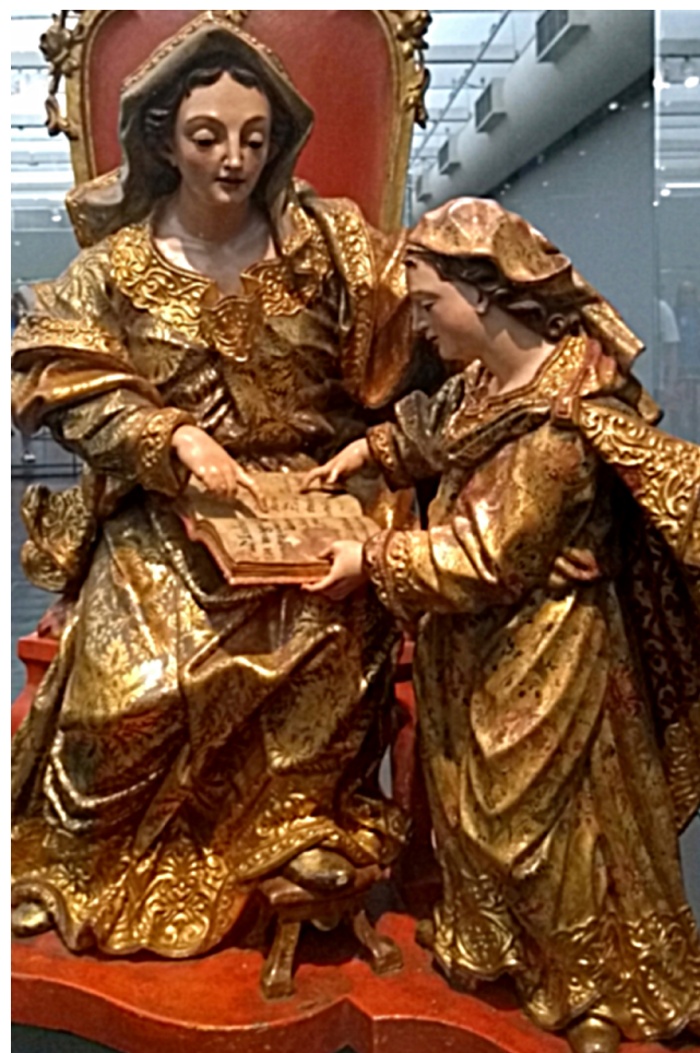
Source: 1778–1779, sculpture by Aleijadinho, Gold Museum, Sabará, Minas Gerais State, Brazil. Public domain.