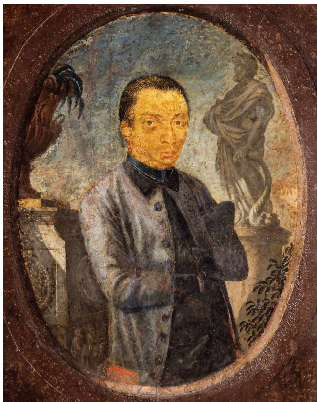
Source: 1800-?, Euclásio Penna Ventura’s painting, Congonhas Museum, Congonhas do Campo, Minas Gerais State, Brazil. Public domain.

The scope of the present study was to elucidate the most probable diagnosis of Aleijadinho’s disease and discuss other diagnosis suggested in the literature.