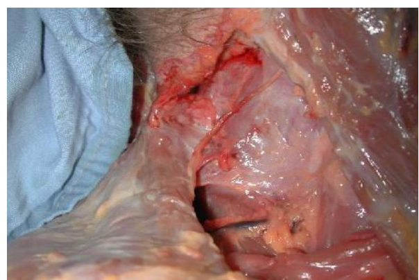
Figure 1 Trajectory of the spinal accessory nerve in the posterior triangle (cadaveric dissection).

Patients generally signaled incremental improvement during resection of fascia and/or interfascicular septae within the trapezius. Although the SAN neurolysis in