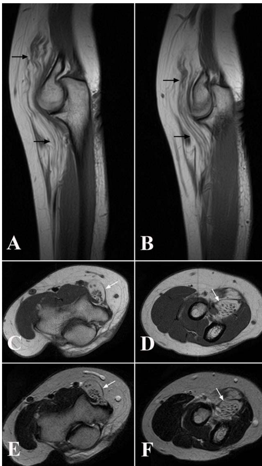
Figure 1 Magnetic resonance investigation (MRI) of the patient showing specific characteristics of a fibrolipomatous hamartoma (arrows) in sagittal sections (T1 weighted in A and B) and in axial sections (T1-weighted in C and D; T2-weighted in E and F) at the elbow region.