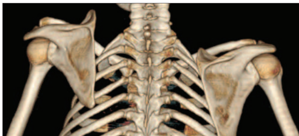
Figure 2. 3D CT reconstruction of the left shoulder.

The patient was discharged from hospital with a Constant-Murley score of 45 points, and continued rehabilitation as an outpatient at a clinic near to her own home.