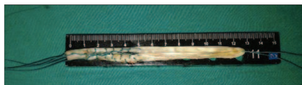
Figure 1. Graft length measurement with ruler. Intraoperative photograph of quadrupled hamstring tendons (gracilis and semitendinosus tendons).

In total, 126 male patients with a mean age of 24.2 \pm 4.65 years who underwent ACL reconstruction surgery were included in this study. The operation was performed on 56 left knees and 70 right knees. The patients had a mean height of 176.28 \pm 5.40 cm and a mean weight of 77.91 \pm 8.13 kg, while their mean BMI was 25.07 \pm 2.28 kg/m 2 . The mean graft diameter was 8.14 \pm 0.61 and the mean graft length was 13.25 \pm 1.18 .