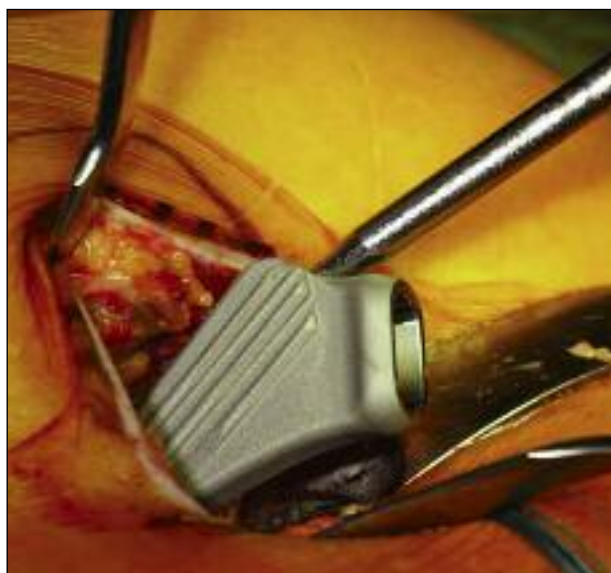
Fig. 2. Left hip. CLS Brevius Stem insertion: three longitudinal fins are present on the anterior and on the posterior surfaces of the proximal part of the stem.

The purpose of the current study was to evaluate the functional, radiological and survivorship outcomes of the cementless CLS Brevius Stem in a multi-surgeon,