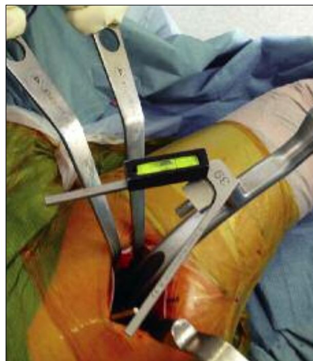
Fig. 3. Right hip. During the acetabular component positioning phase, a tilt-meter is connected to the cup holder to allow the inclination of the implant to be adjusted for pelvic tilt.

Antibiotic prophylaxis was performed using a first generation cephalosporin, which was administered 30 minutes before the surgical incision and for 36 hours postoperatively.