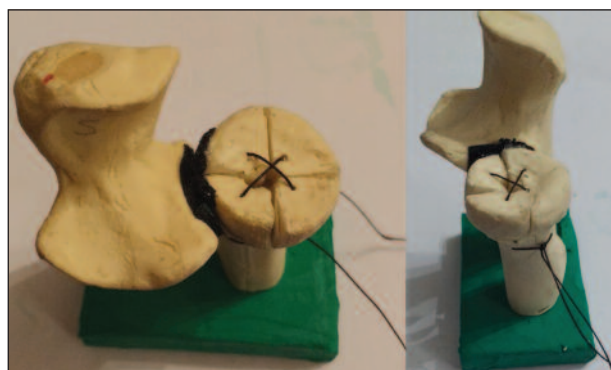
Fig. 3. Once the suture thread has been tightened, the final suture makes it possible to obtain good reduction of the bone fragments (Sawbone model of the left proximal forearm).

preferable to open reduction and internal fixation in the management of Mason 3 fractures (12).