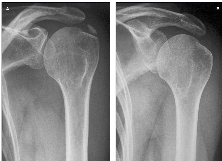
Fig. 3. Radiographic examination of a left shoulder with Type A calcification before surgery (A) and at follow-up (B).

The patients' Constant, ASES, UCLA, SST and VAS scores are reported in Table 2 .