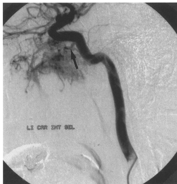
Figure 2. Left internal carotid artery angiogram. The inferolateral trunk (arrow) is dilated and contributes significantly to the blood supply of the tumor.