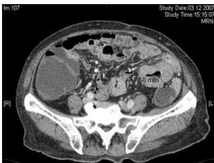
Fig. 2 Contrast-enhanced hydro-CT scan showing thickened wall of the jejunum and enlarged lymph nodes, suggestive of lymphoma infiltration.

A 78-year-old woman was transferred to our hospital with a history of chronic anemia (hemoglobin 80–90 g/L) for several months that was refractory to iron treatment. Repeated gastroscopy and colonoscopy showed no abnormal findings. During the ensuing wireless capsule endoscopy, mucosal changes interpreted as 'possibly ulcerations' located within the distal part of the jejunum were identified as a possible source of bleeding. We performed double-balloon enteroscopy (DBE) to confirm these findings and carry