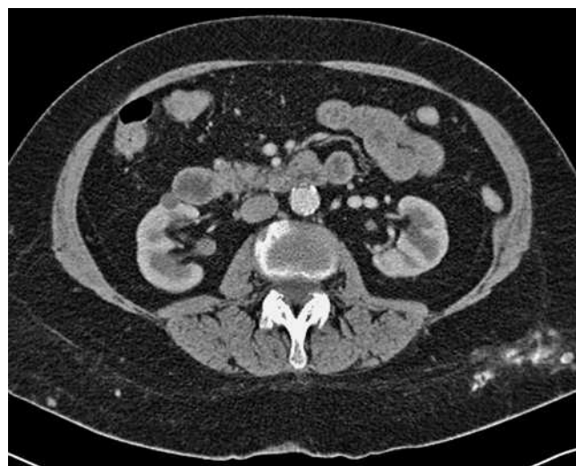
Fig. 3 A computed tomographic view of a 1.5-cm, solid-looking mass on the anterior aspect of the right kidney, an appearance in keeping with either a small renal cell carcinoma or a benign oncocytoma.