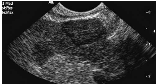
Fig. 2 Linear EUS view of the echo-poor exophytic renal lesion first identified on radial EUS.