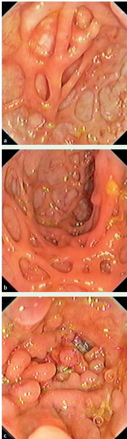
Fig. 1 Colonoscopy showed severe bridging fibrosis in the left colon and the sigmoid colon (a,b). There were also areas with pseudopolyps and a moderately severe stricture that was difficult to pass with the colonoscope (c).