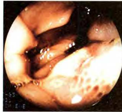
Figure 1: Colonoscopy showed an elevated-type red lesion accompanying a small ulcer in the center.