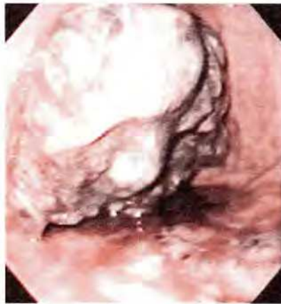
Figure 1: Endoscopic image of a large, black-pigmented, polypoid and superficially ulcerating mass in the gastric cardia. There are several spots of increased pigmentation lateral to the main mass.