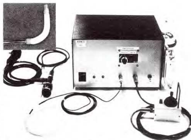
Figure 1: SMA catheter system. The tip of the SMA catheter (upper left) is in the bent position of the flexible tip which was obtained by heating.