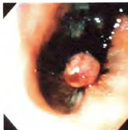
Figure 2: Pedunculated polyp created by application of a rubber band around the base of the lifted tissue.