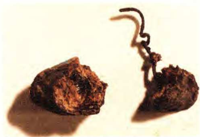
Figure 1: Surgical thread protruding from a crushed bile duct stone.

These cases are presented here in order to draw attention to the potential attachment of suture material to the lumen of the bile duct, and the implicit dangers. Although we have not been able to establish the mechanism for this phenomenon – it may result from the surgical technique – it is undoubtedly associated with the use of hard or nonabsorbable suture materials in bile duct surgery.