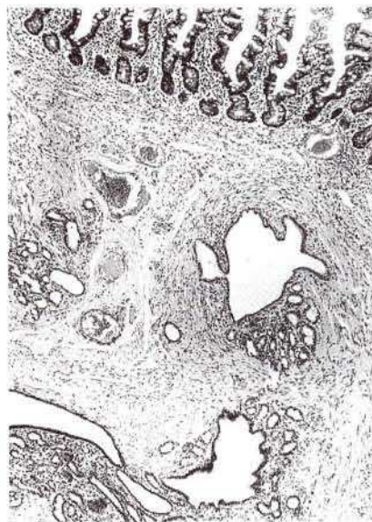
Figure 2: The histologic features are consistent with an adenomyoma (hematoxylin-eosin x 82).